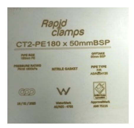
FIGURE 2 EXAMPLE OF MARKING